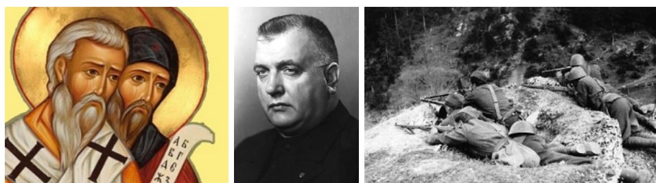
St Cyril and St Methodius

Slovakia was settled by Slavic Slovaks about the 6th century. In the 9th century Slovakia became part of the state of Great Moravia. St Cyril and St Methodius converted Slovakia to Christianity in 865. In 907, the Germans and the Magyars conquered the Moravian state, and the Slovaks fell under Hungarian control from the 10th century up until 1918. After World War I, in 1918 the Czechoslovak Republic was established. A puppet state was created out of Slovakia with Monsignor Josef Tiso as a prime minister in 1939. It officially collaborated with Germany. However, in 1944 Slovakia was the place of a great anti-fascist uprising – the Slovak National Uprising. After the war, the Czechoslovak Republic was established again and lasted till January 1st 1993 when the sovereign Slovak Republic came into existence after split-up of the former Czechoslovakia.